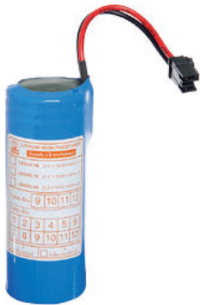
Model: ED3236-1B Nominal voltage: 3.2 V Nominal capacity: 3600 mAh For DYNO emergency light model: EPD-209