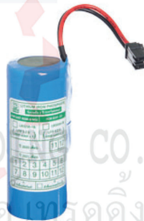
Model: EXTA36-1B Nominal voltage: 3.2 V Nominal capacity: 3600 mAh For DYNO exit light model: XLF-S10N/R, XLF-S15N/R, BXF-10N/R, TSF-10N