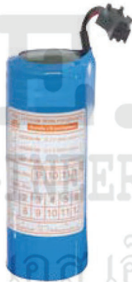
Model: TFNX36-1B Nominal voltage: 3.2 V Nominal capacity: 3600 mAh For DYNO night light model: NGL-D/A-LT09W3K0-R-LG/MG