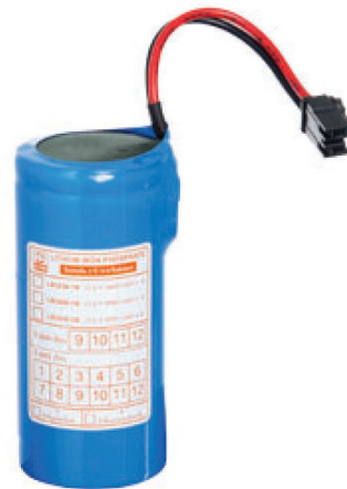
Model: LB3260-1B Nominal voltage: 3.2 V Nominal capacity: 6000 mAh For DYNO emergency light model: LFG-09P3T, ECP-2T, RES-09P3T